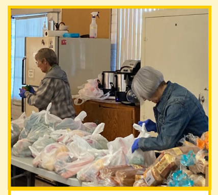
Ladies from DCUMC getting our giveaway food items table ready for Saturday customers.